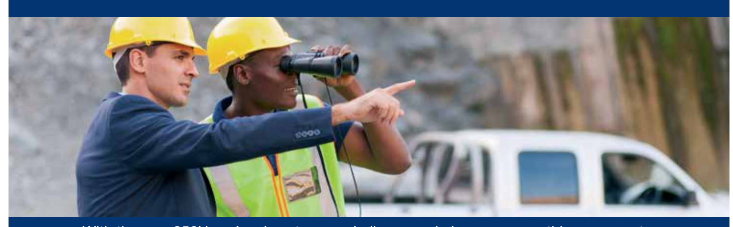
With the new 856H, we've risen to your challenge and given you everything you want a tough, credible wheel loader - built without compromise.